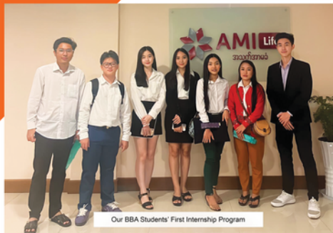
Our BBA Students' First Internship Program