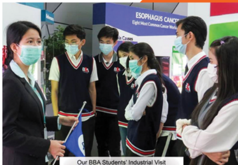
Our BBA Students' Industrial Visit