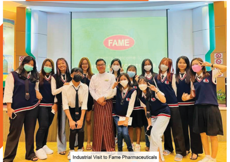
Industrial Visit to Fame Pharmaceuticals