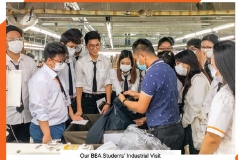
Our BBA Students' Industrial Visit