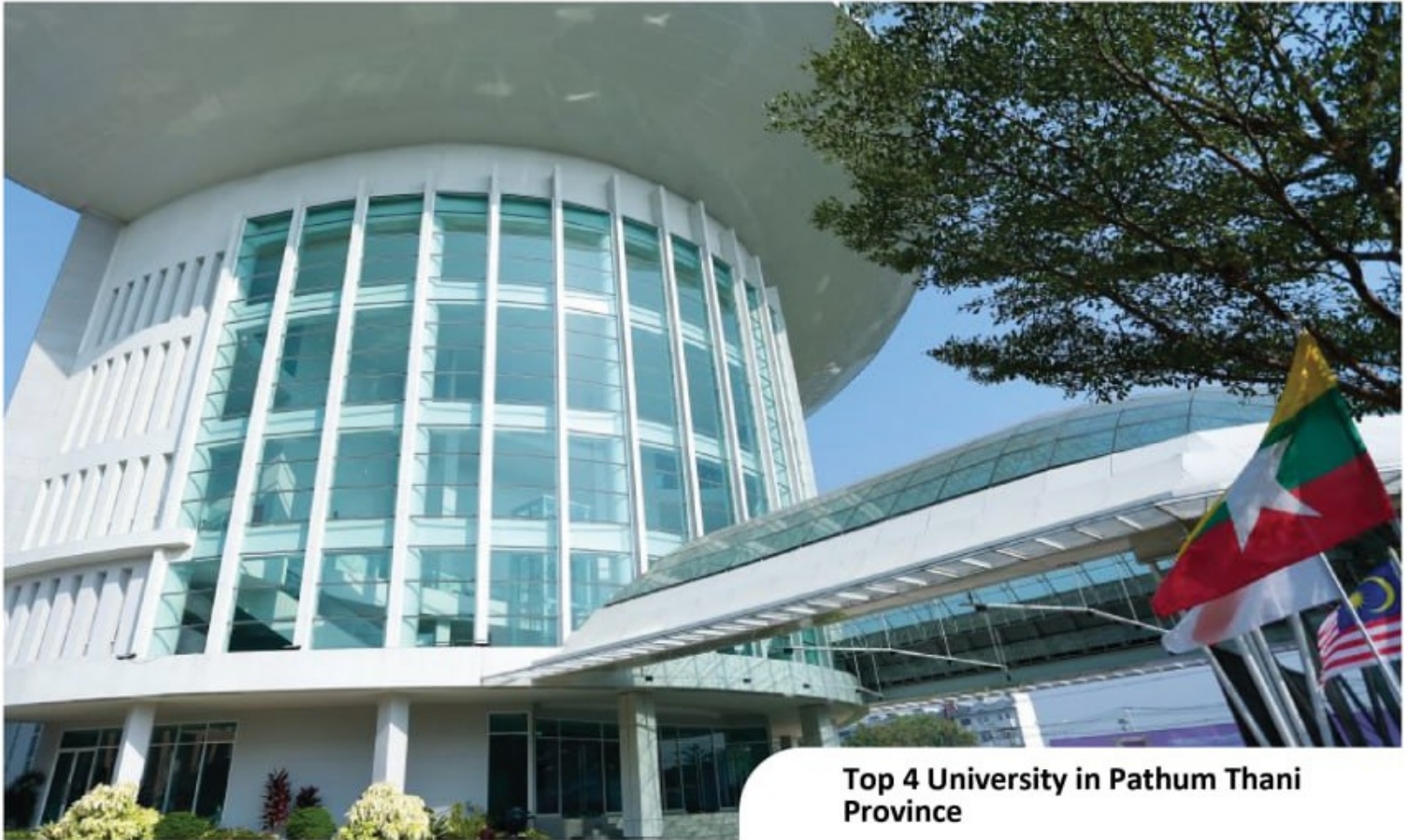
Top 4 University in Pathum Thani Province