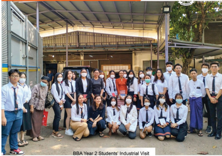
BBA Year 2 Students' Industrial Visit